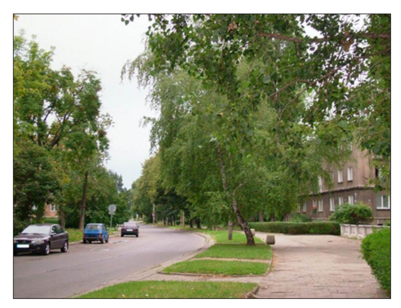
Fig. 2. Cracow – Nowa Huta – greenery isolating a local street