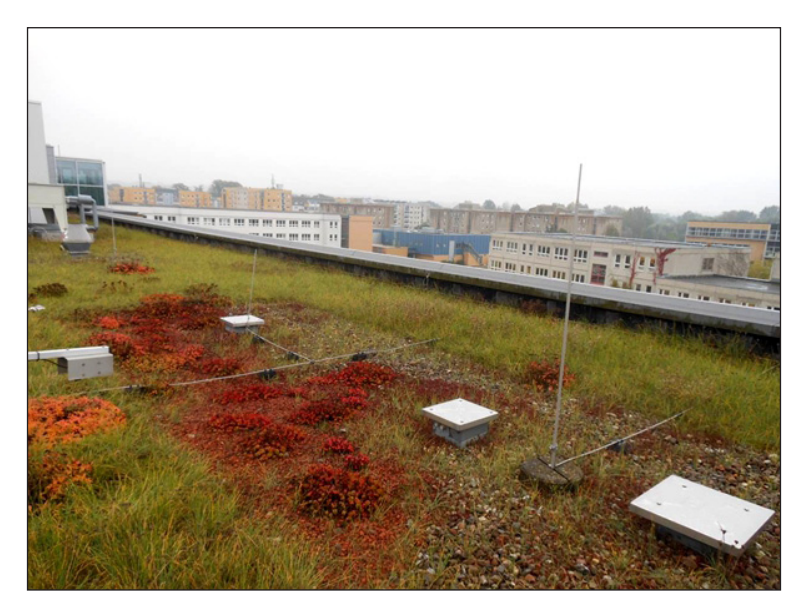
Fig. 4. Neubranderburg, Germany – the roof of the Hochschule building with a rainwater system

proves the condition of soil and water. Greenery helps to keep the soil stable and makes it resistant to erosion. The root system stabilizes the soil and allows rainwater to be quickly absorbed from the surface. It also prevents local floods, especially in the areas located in depressions.