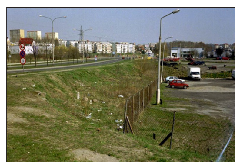
Fig. 1. Olsztyn – Obrońców Tobruku street – "wind tunnel"

Greenery allows for the proper airing out of the city, ensures optimal moisture level and im-